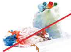
NO Loose Plastic Bags, Bagged Recyclables or Film

Empty recyclables directly into your bin.