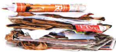
Paper Brown paper bags, non confidential office paper, newspaper, magazines