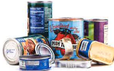
Food & Beverage Cans Steel, tin & aluminum soda, vegetable, fruit & tuna cans