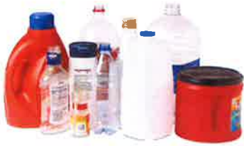
Plastic Bottles, Jars & Jugs (labeled #1 and #2)