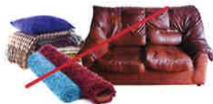
NO Clothing, Furniture & Carpet