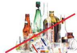
NO Glass Bottles & Containers

Empty recyclables directly into your bin.