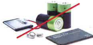
NO Batteries – check local programs for proper disposal

To learn more, visit: wm.com/recycleright