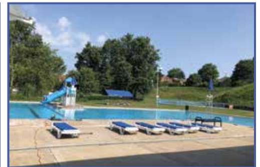
Baldwin Community Pool