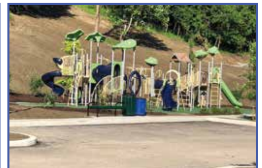
Elm Leaf Park